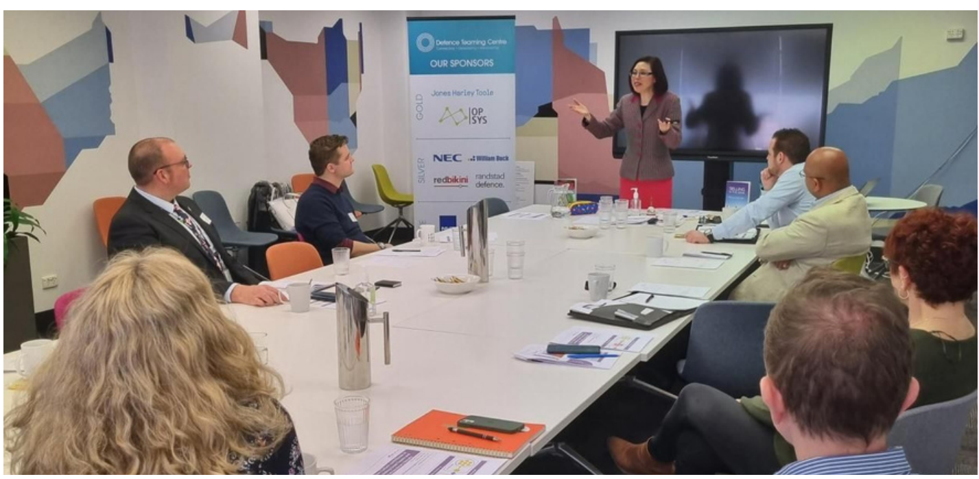
DTC members taking part in a Culture and Leadership course.