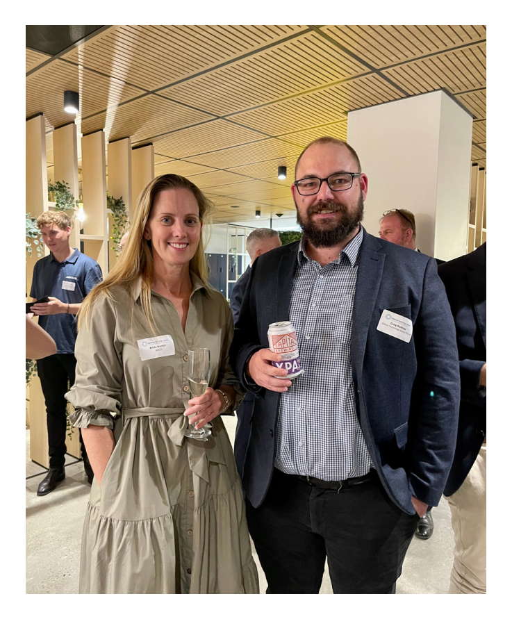
BD After Five networking events are held in SA, ACT and NSW.