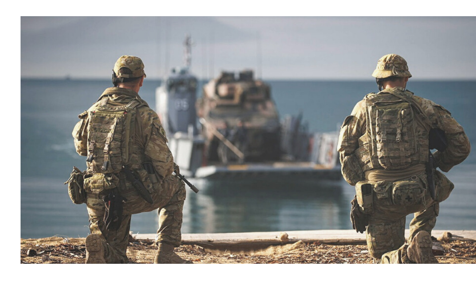
Defence Teaming Centre is not an agent or part of, nor affiliated with, the Australian Government or the Department of Defence